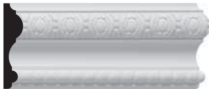
ADM 655 11/16" x 3" 17mm x 76mm