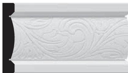
ADM 678 11/16" x 4" 17mm x 102mm