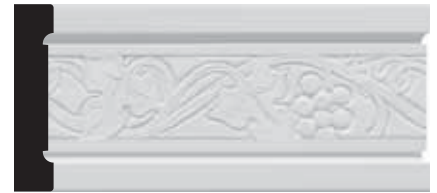
ADM 677 11/16" x 3-1/4" 17mm x 83mm