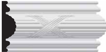
ADM 670c 1-1/16" x 3-1/2" 27mm x 89mm