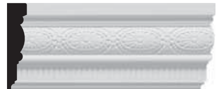
ADM 654 11/16" x 3" 17mm x 76mm