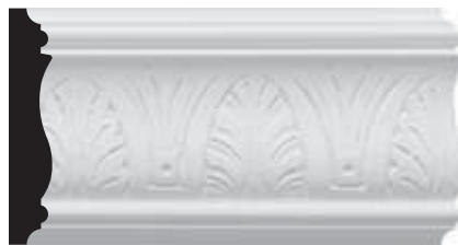
ADM 672 11/16" x 3-3/4" 17mm x 95mm