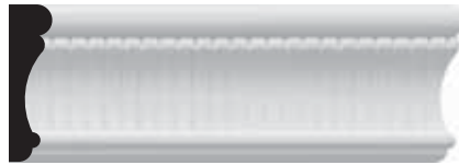
ADM 651 11/16" x 2-1/2" 17mm x 64mm