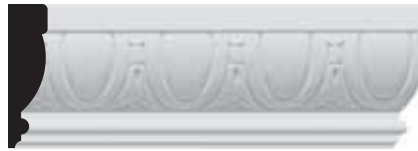
ADM 653 11/16" x 2-1/2" 17mm x 64mm