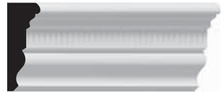
ADM 652 1-1/8" x 3" 29mm x 76mm