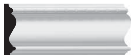
ADM 656 11/16" x 3" 17mm x 76mm