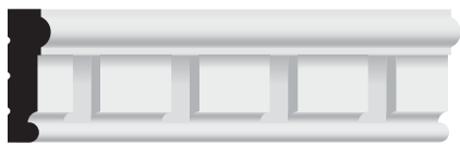
ADM 650 11/16" x 2-1/8" 17mm x 54mm