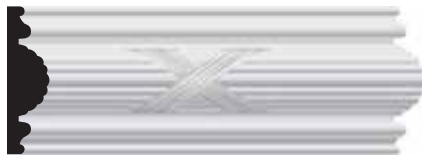
ADM 670b 3/4" x 2-9/16" 19mm x 65mm